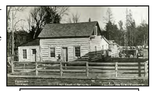
The cabin in its original location when occupied by the Deleglise family

the dark, to Springbrook to guide the rest of the family who had lost its way.