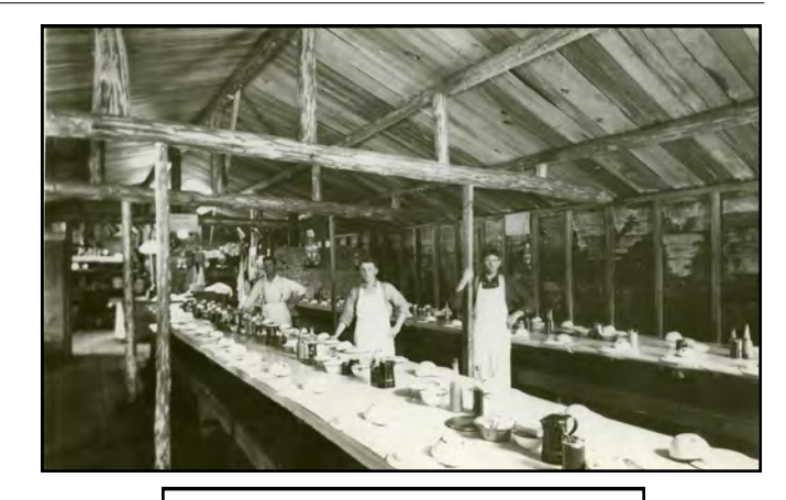
Mess Hall in the Lumber Camp

She noted that one winter the beef was provided by oxen that were no longer fit for work.