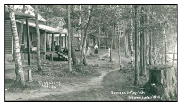
Rental Cottages Pelican Lake early 20th century

Summertime, fishing and northern Wisconsin are all linked and not just because Antigo is the home of internationally known Mepps lures.