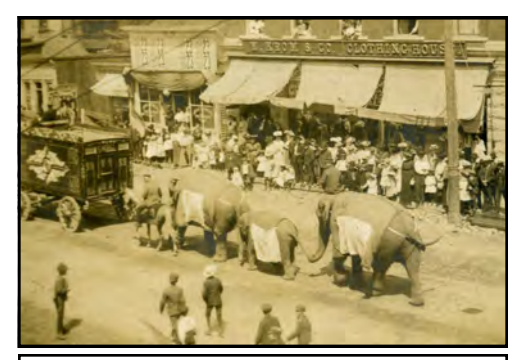
Circus Parade on Fifth Ave. on July 23, 1906

Antigo, like most of Wisconsin, has a history of circus involvement.