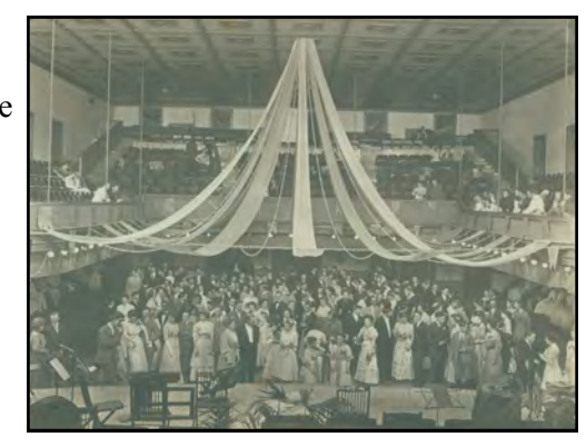
The Opera House hosted the high school prom in 1911

Today the Opera House contains apartments.