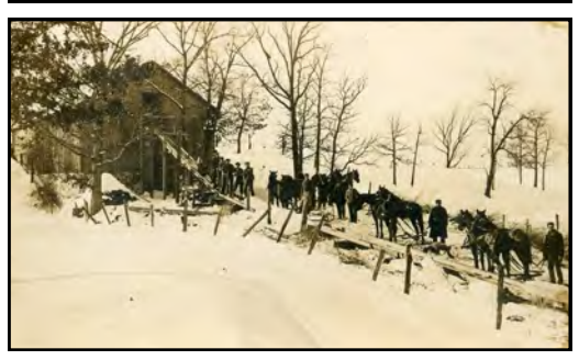
Cutting and hauling ice from Kellogg's Pond