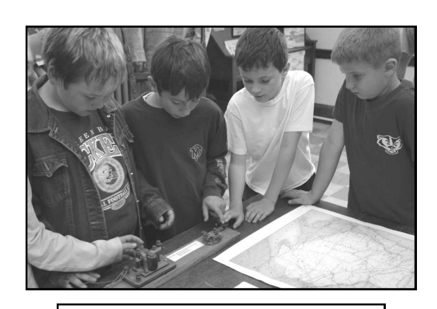
Students from West examine a telegraph key .