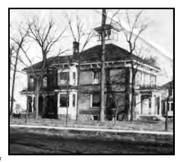
The Daskam mansion before Superior Street was paved.

In 1933 with the opening of Langlade Memorial Hospital, the building ceased being a hospital and in 1935 was converted into apartments.