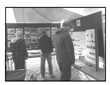
The display at Kretz Lumber Days featuring old photos, tools, and a display of CCC camp in Elcho.

This past September the museum once again had a display at Kretz's Lumber Days. In addition to tools and photographs of lumbering in the past, we featured material on the CCC camp at Otter Lake near Elcho and its role in forestry in the 1930's.