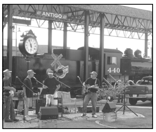
The Pine Tones provided music at last year's railroad park picnic. They will perform again at this year's picnic on June 23.

Antigo was just a small cluster of homes and stores until the railroad expanded northward from Eland in 1880. The Chicago and Northwestern made Antigo headquarters its northern division in 1907 and from then, for the next half century, Antigo was a "railroad town."