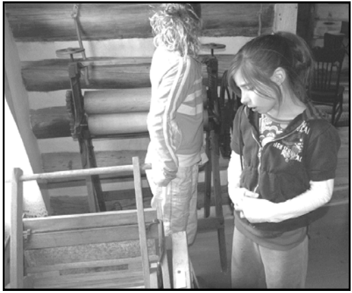
Students wonder at old laundry methods as they study a wash tub and mangle in the Deleglise cabin.

various Civil War battles, his business life in Antigo, his role in the growth of Antigo, and the social life of his children and grandchildren.