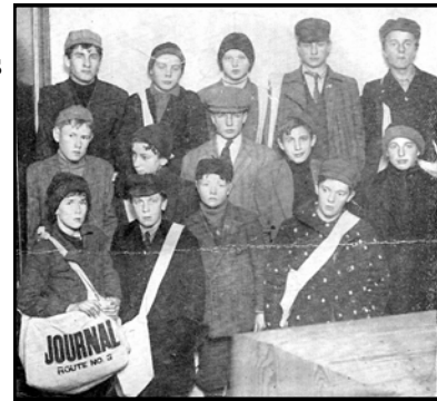
Antigo Daily Journal Carriers in 1911