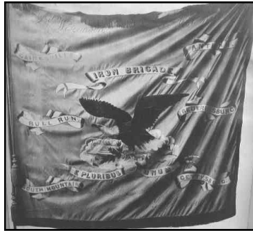
The banner of the Iron Brigade listing the battles in which they took part.

in Switzerland. Some letters are at the museum and vividly describe his training at Camp Randall and the horrors he lived through. From time to time, we will quote from those letters as we commemorate the Civil War sesquicentennial.