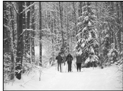
Left: The map shows the Green Bay Lobe meeting the Langlade Lobe Above: Skiers enjoy the hills at Jack Lake, a glacier feature, part of the Ice Age Trail

To many residents and visitors to Langlade County some of the best sections of the trail are right here.