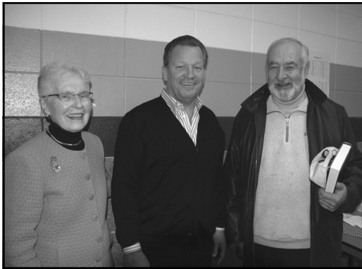
Author James Bradley (center) at the Antigo High School where he signed and spoke about his latest book: The Imperial Cruise .