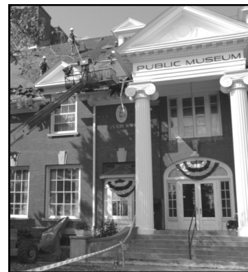
Our new roof was completed this fall. You can still make donations to this project.