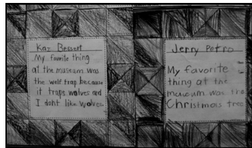
A detail from the Crestwood Grade 2 class thank you card listing some favorite displays.

Other special groups included school classes from All Saints 2nd grade and 6th grade, Middle School 8th Grade, Crestwood 2nd Grade, Elcho Cub Pack 646 and the Old Time Auto Group of Waupaca.