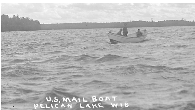
Lower left: Mail delivery at Pelican Lake by boat