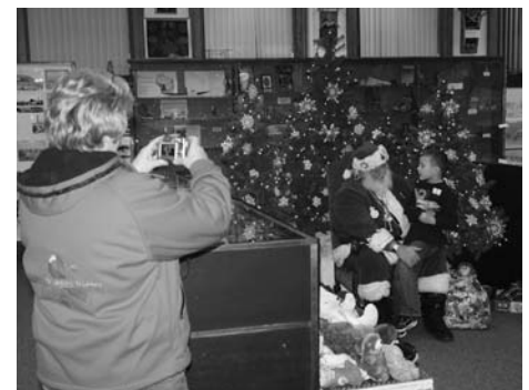
Adults were kept busy photographing the children.

the museum, about 200 children brought an equal number of parents and grandparents to listen in as they offered their wish lists and Santa checked whether they had been naughty or nice. Each child was offered a toy, cookies and a drink of punch thanks to C.A.R. and the museum.