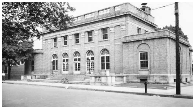
Upper left: Neils Anderson's building was Antigo's second. It served as store, hotel, and post office.